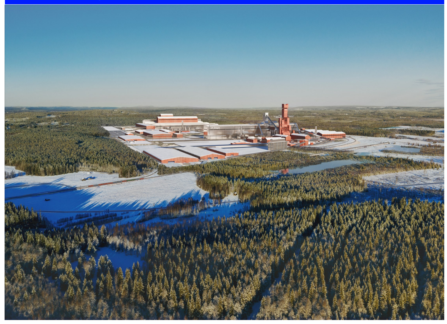
A digital render depicts what Stegra's steel mill outside Boden, Sweden will look like when completed, in this handout image obtained December 16.

(Inside Commodities is compiled by Nandu Krishnan in Bengaluru)