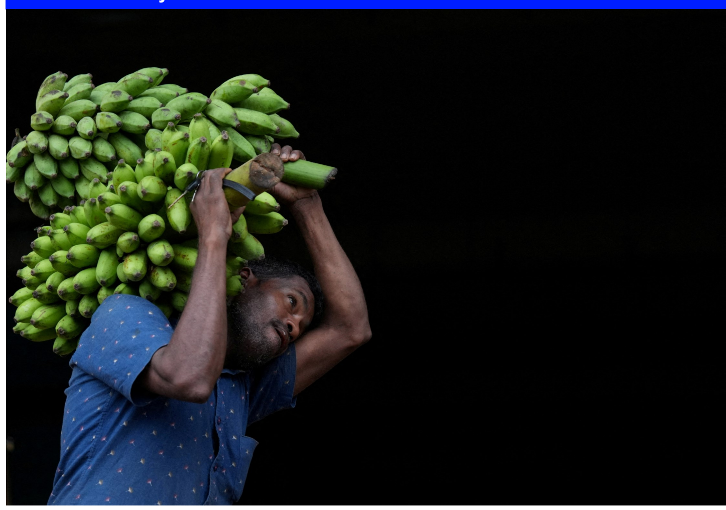
A man carries a bunch of bananas at a market in Colombo, Sri Lanka, November 23.

(Inside Commodities is compiled by Kishore Barker in Bengaluru)